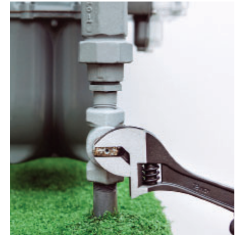
Valve Position OFF