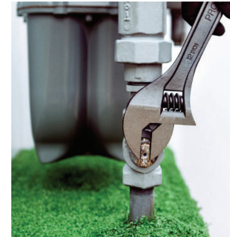
Valve Position ON